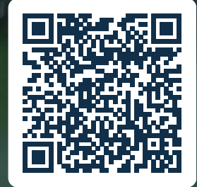
Rotina de trabalho em inglês